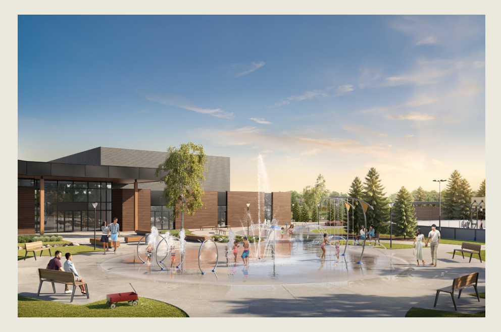
Where fun meets rejuvenation! Designed for children of all ages, our splash park features interactive water play zones, spray jets and surrounding seating areas.